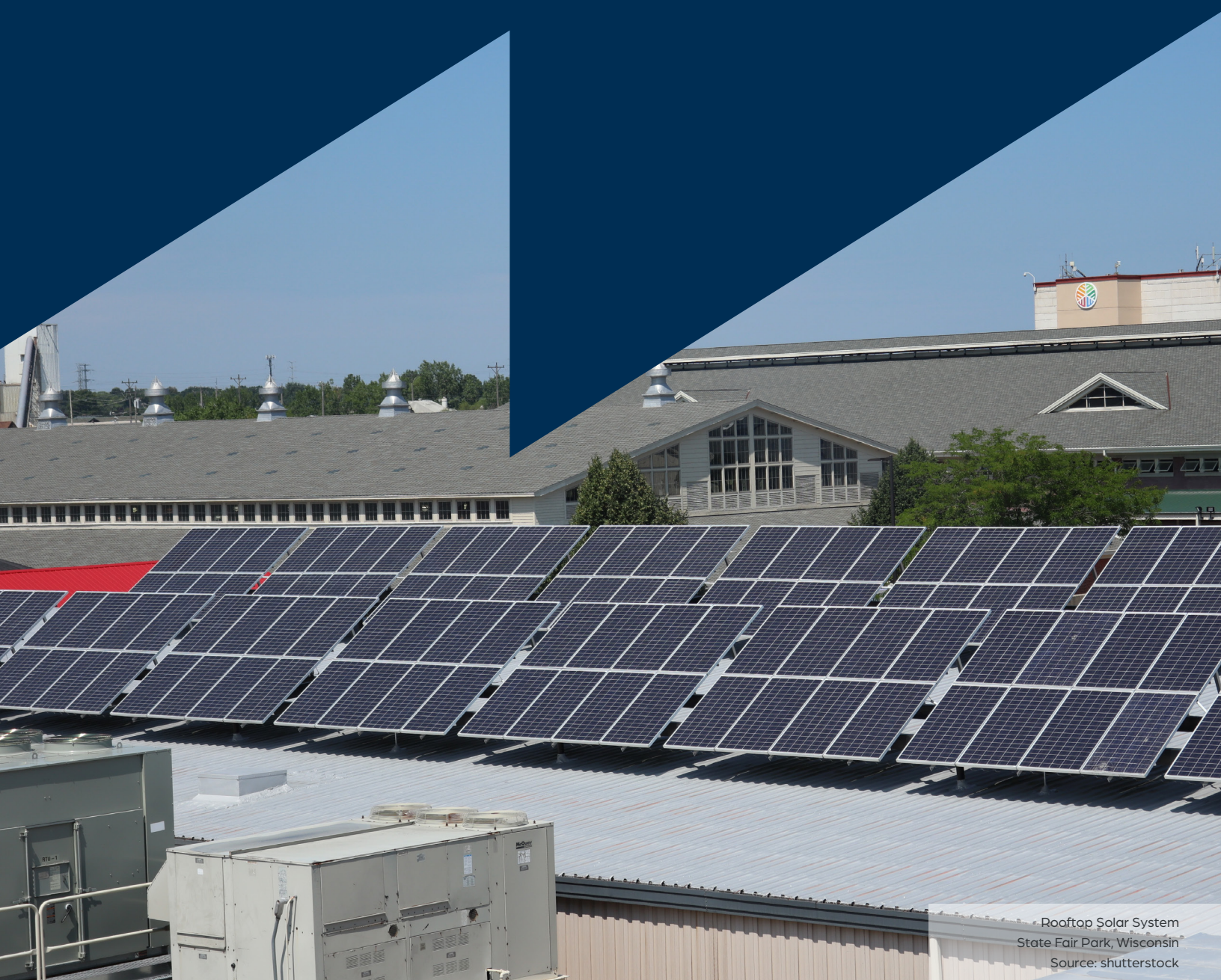
Rooftop Solar System State Fair Park, Wisconsin

If you have questions, email: info@wisconsinforenergyindependence.com