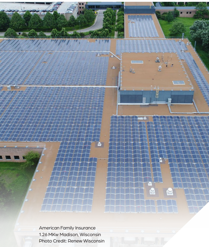
American Family Insurance 1.26 MKw Madison, Wisconsin